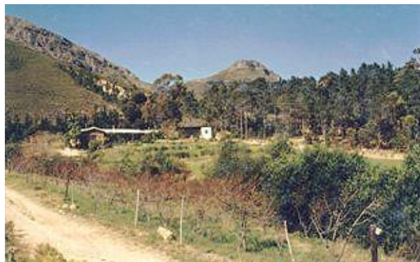
An early picture before development