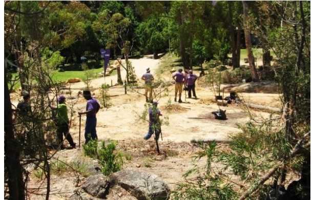
Levelled campsites created in the pine forest

In a bold move, the old pine forest, denuded by fires and regular use was converted into levelled campsites.