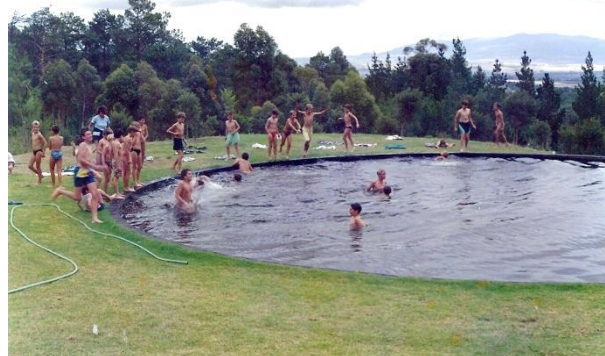
Cubs having fun at the Dam